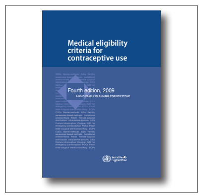
Figure 1. The four cornerstones of family planning guidance